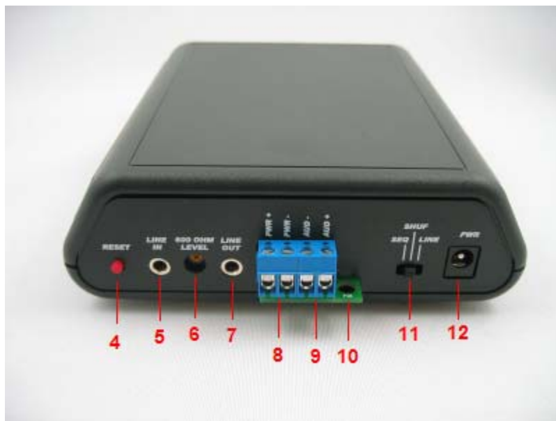
Fig. 2 – StudioMP3 rear view