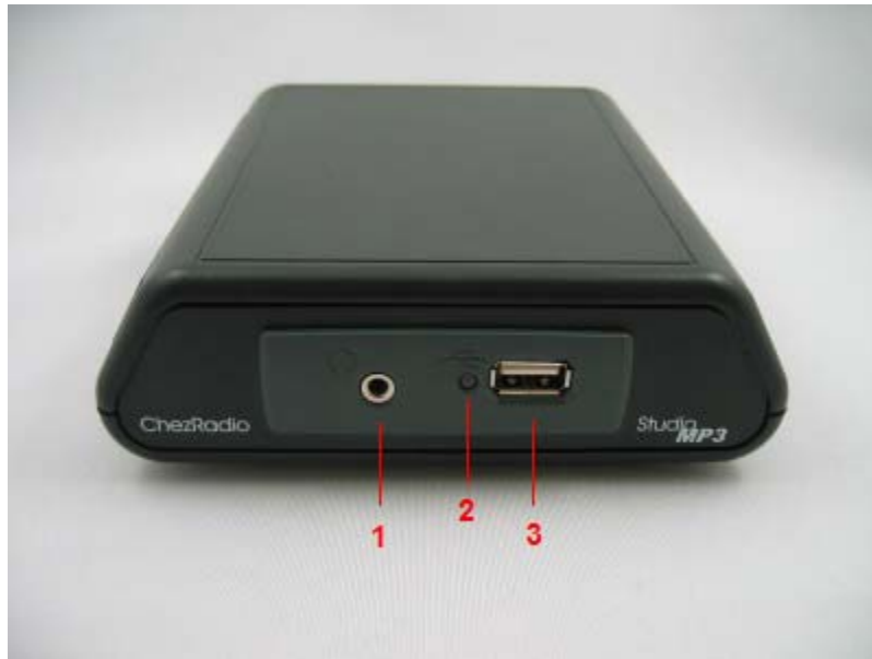
Fig. 1 – StudioMP3 front view